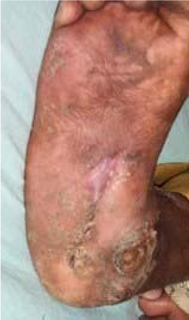
FIGURE 6 The heel develops a deeply situated surgical scar over which the surrounding tissues were laid, forming thick cushions on either side of the incision.

Gaenslen's technique is recommended for refractory cases or patients with a draining sinus centrally located on the plantar aspect of the heel. In general, excision of the calcaneus for chronic osteomyelitis in children is not necessary 9 . The resultant scars usually are painless. They are so deeply situated that the tissues on either side curl inward.