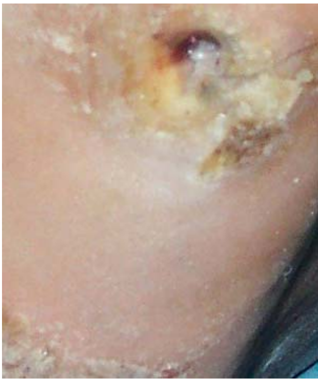
FIGURE 1 The patient's right heel showed a circular, 4 cm diameter, non-healing ulcer with seropurulent, draining sinus.

The quadratus plantae muscle and plantar ligament were split longitudinally. The calcaneus was visualized. It was divided from posterior to anterior with a broad osteotome and split into two halves to expose the interior of the bone (Fig 3). Sequestra, infected material, necrotic slough, damaged cortex were removed. Thorough lavage was given.