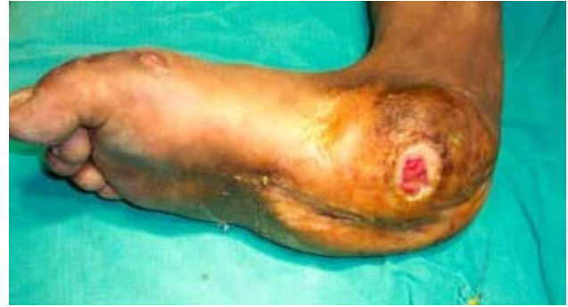
FIGURE 4 2 weeks after surgery, a small pressure ulcer developed just below the medial malleolus.

Partial calcaneotomy is not a new procedure. Four reports, between 1931 and 1959, discussed resection of all or part of the calcaneus for the treatment of conditions as diverse as osteomyelitis of the calcaneus, cutaneous ulceration of the heel, and fracture of the calcaneus 2,3,4 . These authors reported that all of the patients were managed successfully and maintained their functional mobility. Reports published between 1972 and 1991 also documented favorable results 1,5,6,7 . However, partial calcaneotomy has not received much attention, and it seems that surgeons are often unaware that it is an option for the management of large ulcerations of the heel or osteomyelitis of the calcaneus.