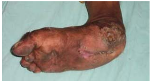
FIGURE 5 The surgical and pressure wounds healed without incident.

Total calcaneotomy is an alternative procedure to trans-tibial amputation in patients with chronic osteomyelitis of the calcaneus. Eradication of infection and preservation of functional ambulation is achieved 8 . Assessment of ankle strength and range of motion of the surgical limb demonstrated decreased dorsiflexion and plantarflexion strength and variable range of motion compared to the contralateral limb 8 . The split-heel technique was successfully used in the management of calcaneal osteomyelitis in children. Antibiotic therapy and debridement when necessary through medial or lateral incisions will usually eradicate the infection.