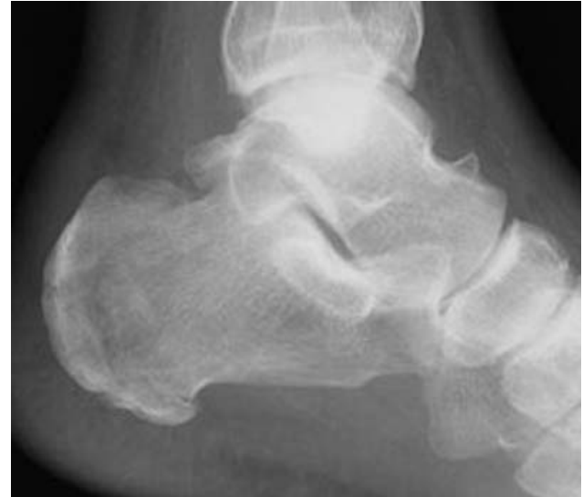
FIGURE 2 The radiograph showed a lytic lesion in the postero-inferior part with a little break in the cortex.

The quadratus plantae muscle and plantar ligament were split longitudinally. The calcaneus was visualized. It was divided from posterior to anterior with a broad osteotome and split into two halves to expose the interior of the bone (Fig 3). Sequestra, infected material, necrotic slough, damaged cortex were removed. Thorough lavage was given.